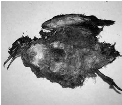
FIG. 1. – Macaronesian Shearwater Puffinus baroli baroli corpse. A great down amount and small wing size can be appreciated.

According to MOUGIN et al. (1992), temperature apparently plays an important role in the chronology and the length of the breeding period. Breeding season is spread over six summer months in the coolest localities, over six winter months in warmer ones, and over the entire year in the warmest. This fact is agrees with our discovery due to the south of El