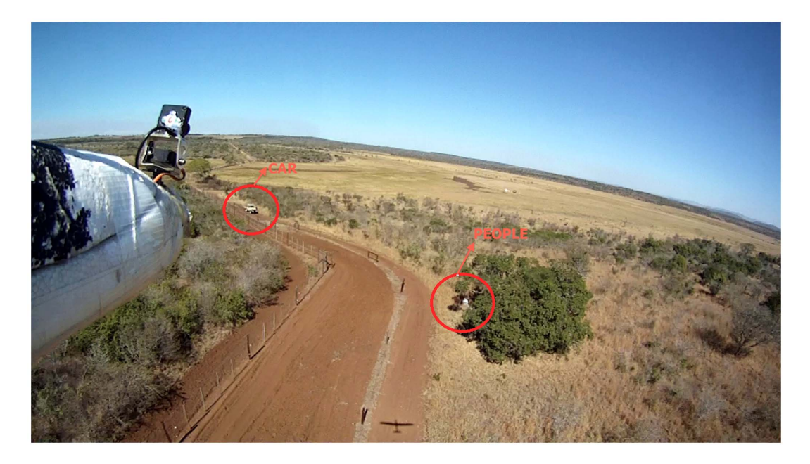
Figure 3. Frame extracted from HD video. People and car near the fence. This image was classified as "high quality". doi:10.1371/journal.pone.0083873.g003

conservation biology studies [18,19]. However, it is a relatively slow procedure, as images must be downloaded after RPAS lands and then reviewed and post processed. Even if pictures were transmitted in real time to the ground station (which is technically possible) accelerating the process, it would still take time to review them. Therefore, the use of a still photo camera would not be suitable to support real time anti-poaching tasks like poachers location during a pursuit. A positive aspect is that still photos would be the best method to provide image proofs against poachers because it offers the best resolution.