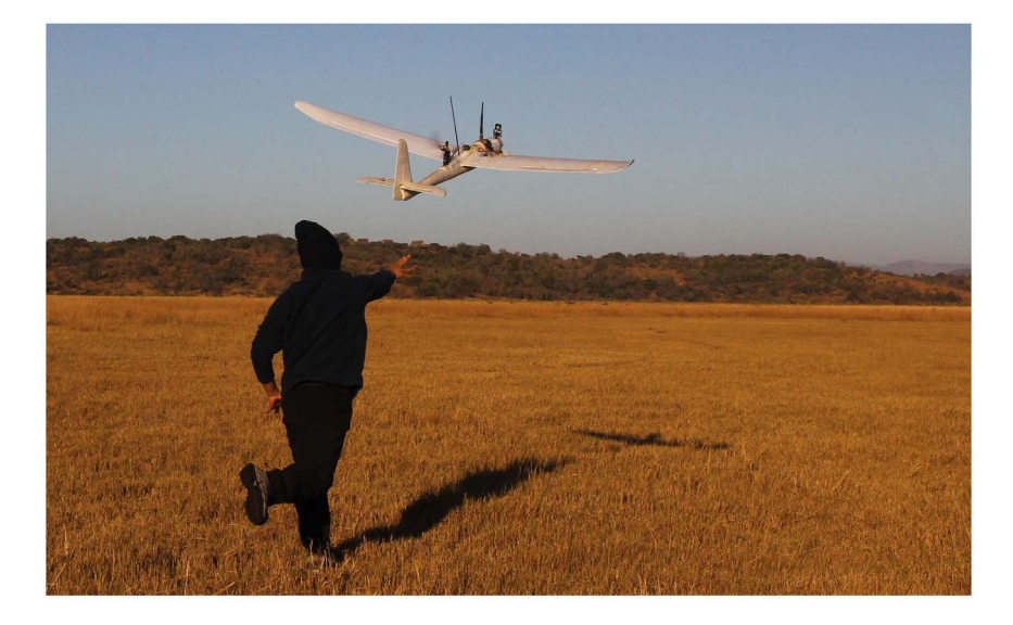
Figure 1. Remotely Piloted Aircraft taking off. doi:10.1371/journal.pone.0083873.g001

Still photo camera: Panasonic Lumix LX-3 digital photo camera 11 MP (Osaka, Japan). It is integrated in the plane wing and aimed vertically to the ground. The camera is activated during the flight at the desired point using a mechanical servo. It is set in speed priority mode and in its widest zoom position.