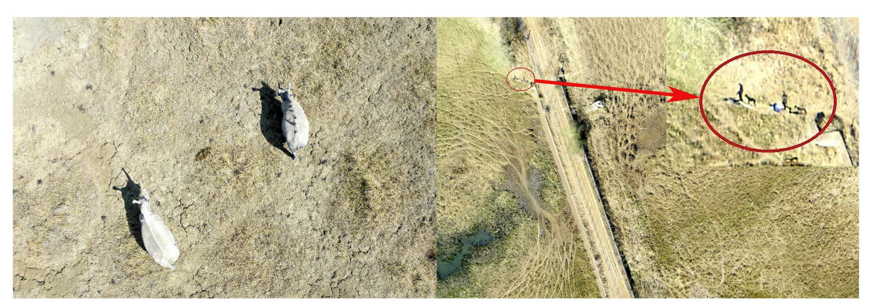
Figure 2. Images obtained with still photo camera. Left: Two rhinoceros (altitude 44 m AGL) in grassland habitat. Right: two people accompanied by two dogs near the fence (altitude 123 m AGL). These images were classified as "high quality". doi:10.1371/journal.pone.0083873.g002

We provide the minimal and maximum altitude at which a target was confirmed in each flight. When only one value is presented it means that the target was located just once. doi:10.1371/journal.pone.0083873.t002